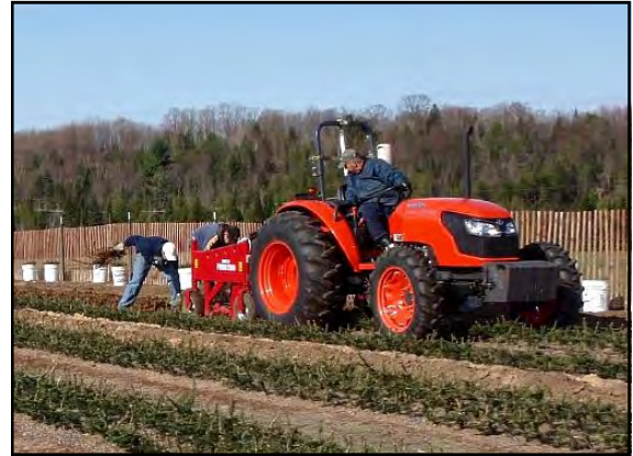
Asack & Son Christmas Tree Farm and Nursery

includes an update on the Christmas tree checkoff program, as well as a review of NHVTCTA business.