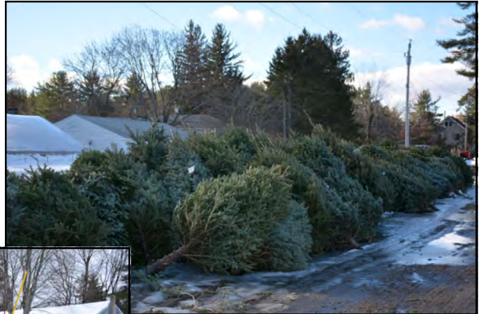
Customers can return their trees for a discount coupon; the trees are then chipped and used to make compost, which is then used to fertilize the trees.

and one wreath. Every year we get back more trees.