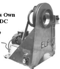
Stainless Steel Garland Machine