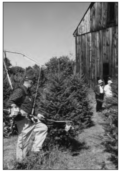
The Walker's barn, as seen at the 2002 Fall meeting, was destroyed by fire in early April. Three other buildings and 300 trees were also lost.

the fire eventually spread in a strong wind to the back of their house.