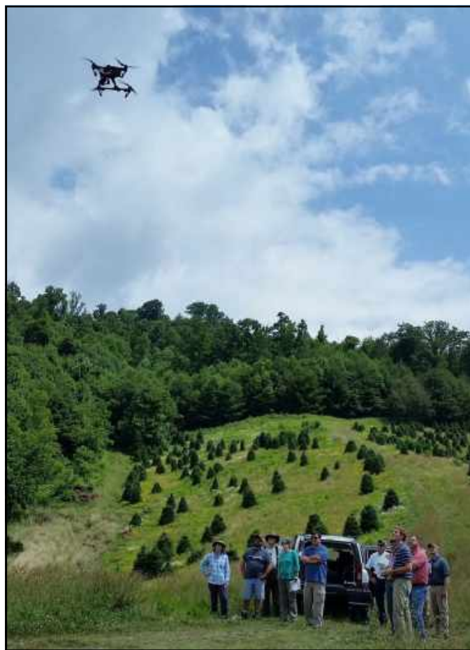
UAS expert Justyna Jeziorska to co-lead a training workshop for extension agents in Boone, NC.

“I don’t want to make people write code,” Jeziorska says. “No one will need to be an ex-