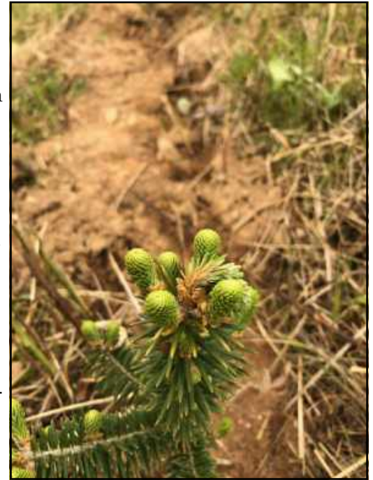
Frost-bitten leader on a Fraser fir transplant.

When that time comes, if the leader was killed, try to select the highest and best surviving shoot. Even a slight height advantage over its neighbors can boost bud or shoot dominance. Leaders should be twice as long as lateral branches to maintain hormonal dominance to the following year. Lateral branches should never be so short that they have only one or two buds left (those will become multiple tops or “horns” next year). If only the base of a lateral shoot remains, consider removing it completely. The absolute worst shearing practice is to cut back hard on the central leader without also trimming lateral