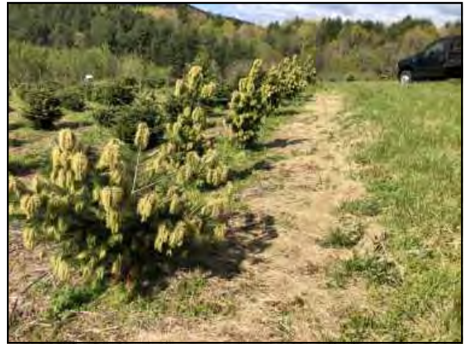
Turkish and Trojan firs injured during May 2020 freeze.