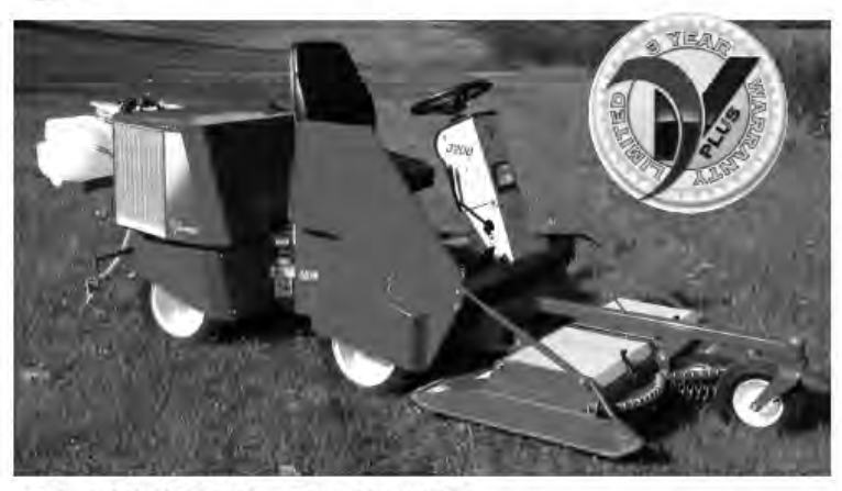
GET ATTACHED - GET IT DONE ... with Ventrac's optional Christmas tree mowing package

A unique mower designed to maintain grass and small brush growth on tree farms, nurseries and blueberry farms.